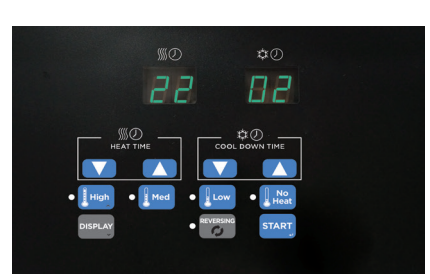
Dual Digital Control